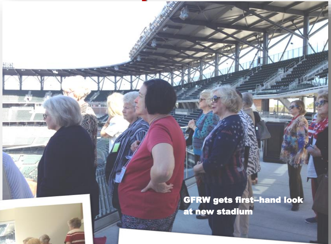
GFRW gets first-hand look at new stadium