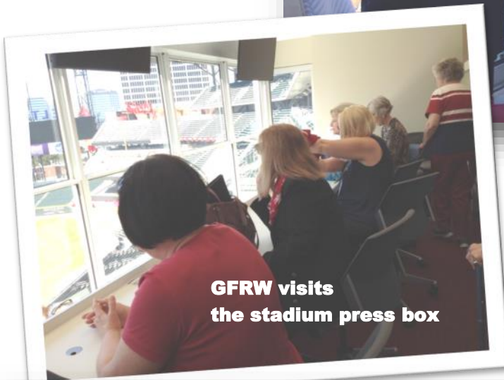
GFRW visits the stadium press box