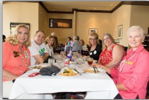
North DeKalb and Central DeKalb Republican Women enjoy lunch together in June.