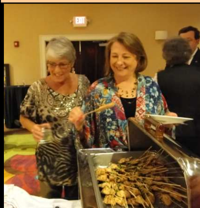
Spring Board Meeting Highlights