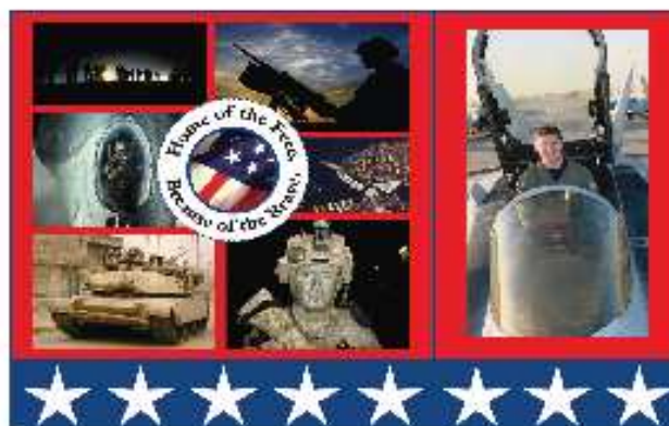
MILITARY TOTE —This reusable shopping tote bag honoring our military will be available this fall for states and clubs to use as a fundraiser.

The committee also is developing a shopping tote bag that will feature photographs from different