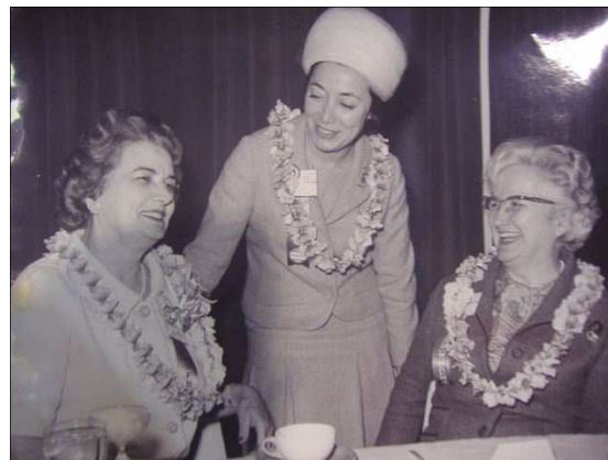
(Continued on next page)

We signed up our members as poll workers and poll watchers, and developed a strong volunteer contingent in local and national elections. We formed the Goldwater Girls for the presidential campaigns, the Victory Girls for state and local campaigns, taught ballot security, went door to door reaching out to our neighbors. Whenever and wherever we spent money, we pitched our candidates—from the supermarket to the gas station to department stores.